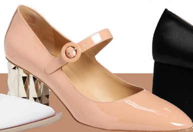
Salvatore Ferragamo Ortensia Mary Jane Pump $730