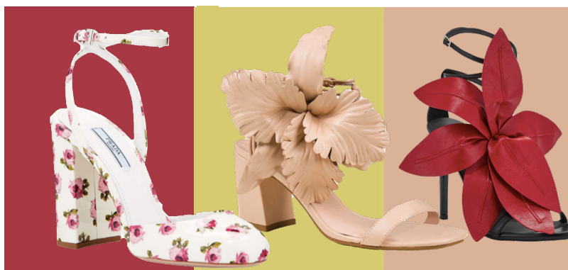
Prada Floral Patent Ankle Pumps $790

Nothing screams warm weather like an oversized Hibiscus flower hanging off your heels. Floral patterns and details of various sizes will add a dramatic statement to your wardrobe this summer.