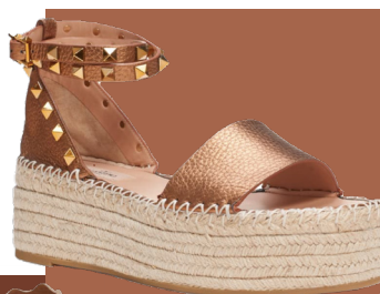
Valentino Garavani Rockstud Ankle Strap Espadrille Sandle $795

A fun combination of sandals and platforms, platforms are hitting this summer market in a big way. Platforms elevate the casual sandal into a heightened staple shoe.