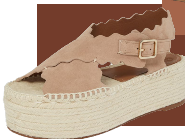
Chloe Lauren Scalloped Platform Sandle $595