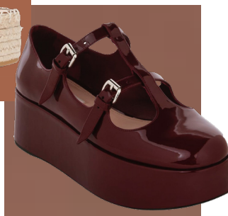
Miu Miu Patent Double-Strap Platform Pumps $750