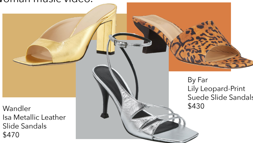
Wandler Isa Metallic Leather Slide Sandals $470