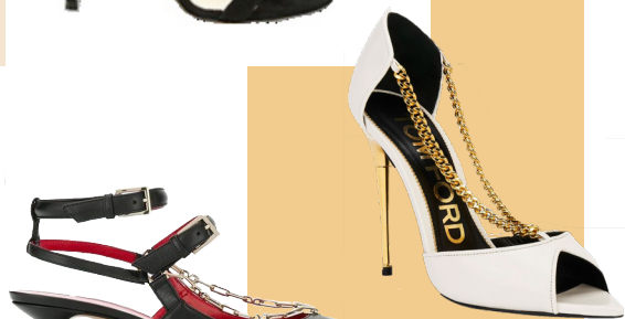
Tom Ford Wishbone Chain Peep-Toe Pumps $1,390

We saw the chain detail hit the market in belts and purse straps a few seasons ago. Now shoes are the bearer of this trend. Chains add a unique edginess to any classic look, providing depth and interest to any outfit.