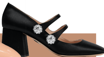
Miu Miu Crystal and Faux Pearl- Embellished Satin Pumps $950