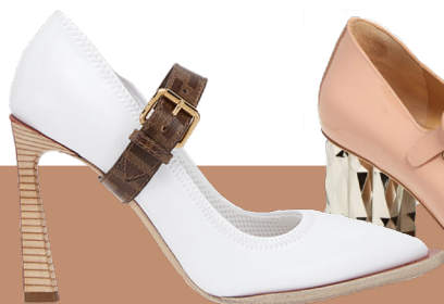
Fendi Mary Jane Glossy White Neoprene Pumps $990

Mary Janes are no longer just found in your grandmother's closet. Chunky heels and jeweled buckles add some personality to the traditional shoe silhouette.