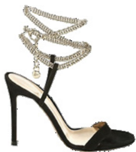
anvito Rossi ebbie Chain Leather ndals ,295