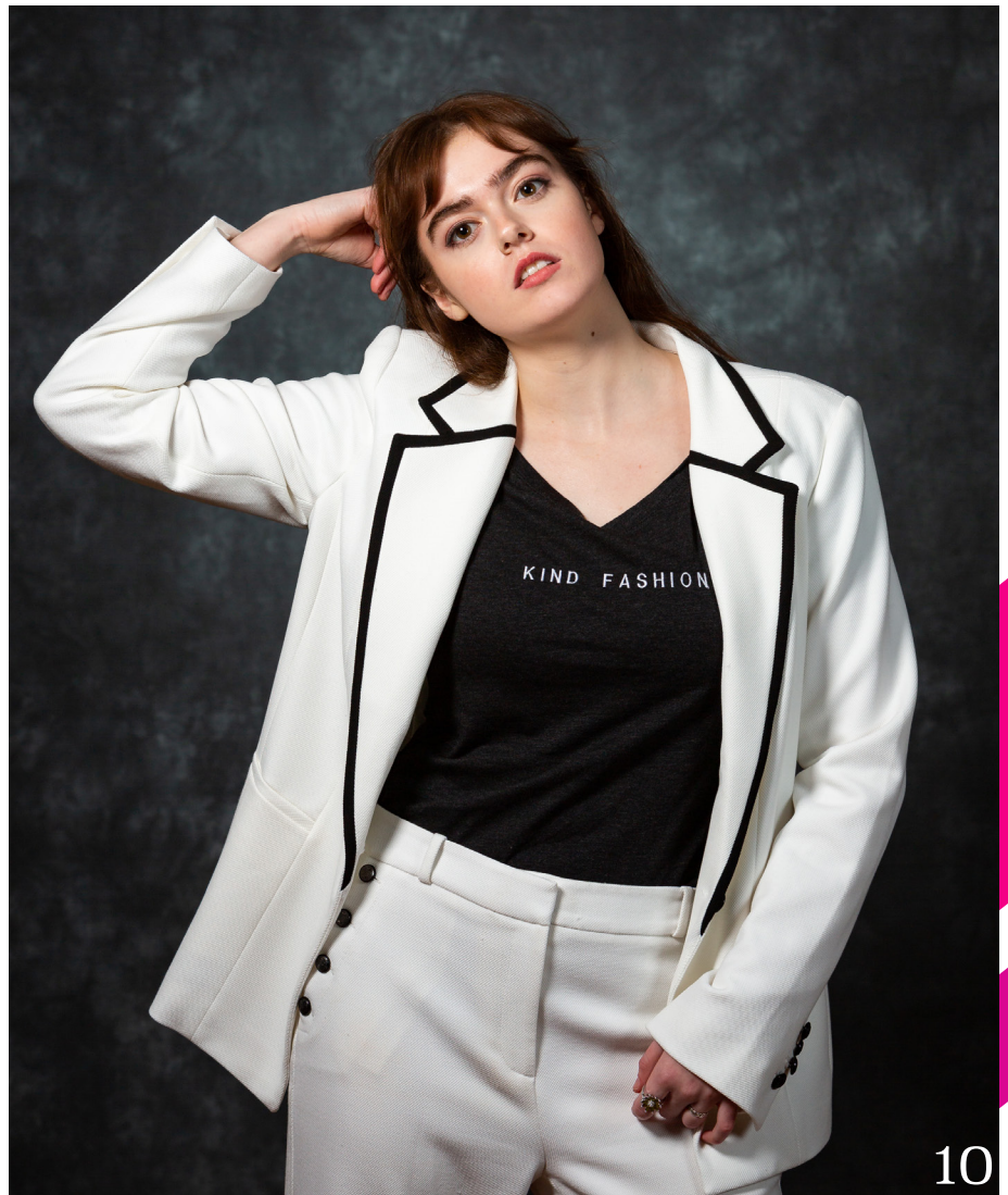
Blazer & Trousers: White House | Black Market Top: KIND FASHION Scoop Neck

Honestly, it's hard to say. My style changes with whatever I'm feeling. One thing you can always count on is me having a blazer on hand. I'm obsessed with them! There is a decent amount of black in my closet, but I like to pop a few colors in there to break it up. I guess you could say my style is classic, daring, and unique.